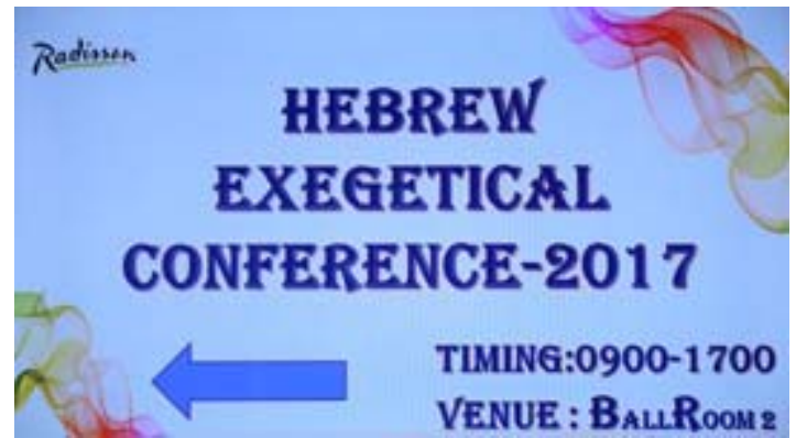
The Timothy Program 2017 Conference was held at the Radisson Hotel, Salem, Tamil Nadu India September 5-7.

The Timothy Program 2017 Conference was held in the Radisson Hotel Ballroom. This three-day event lasted from 09:00 AM until 05:00 PM. Morning tea and a full lunch were served each day to the hundreds of delegates.